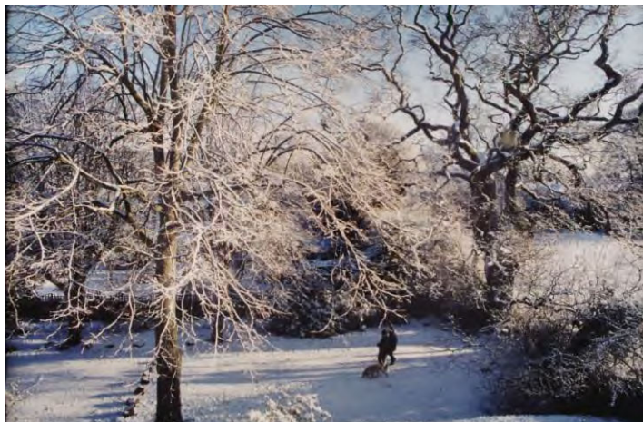
Image 6: February 2004: Two dog walkers exiting Playing Fields into Cheyne Road.