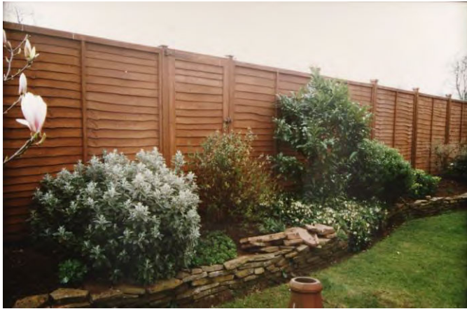
Image 3 – 1996 – Fence had been added with gate at location of original opening/access. No longer in regular use.