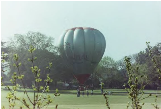
Image 5: 1989 - Hot air balloon about to take-off in the Playing Fields.