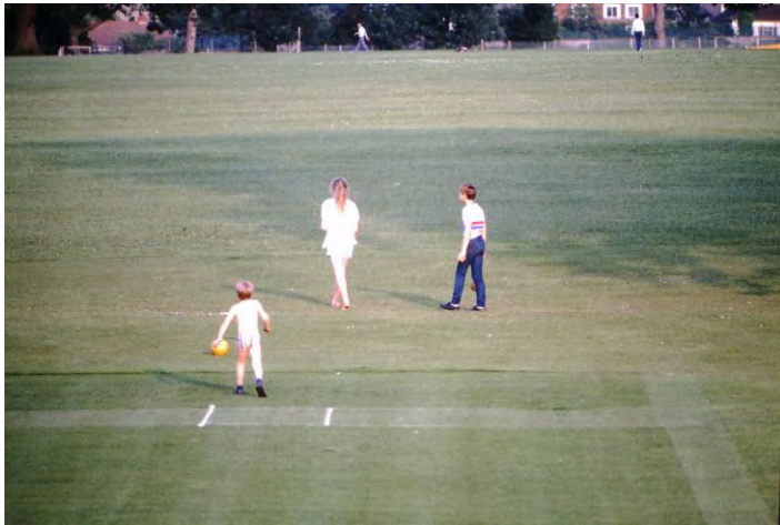
Image 4: May 1984 – My two children, with a friend, playing in the Playing Fields. Note: two other walkers.